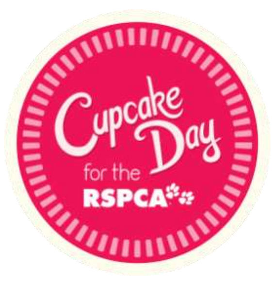
Monday 18th August @ Goul burn High School