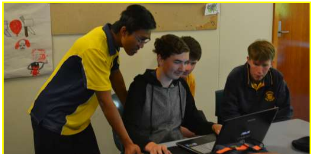
Smith Cup — computing challenge